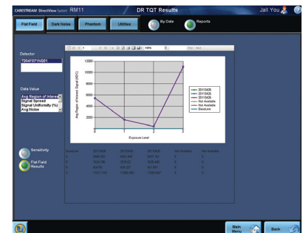
A graph on the first results page shows the most recent test results—and passing ranges—at a glance.