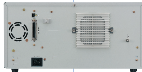
UP-D72XR Back Panel

A standard USB cable connects the UP-D72XR to a Sony FilmStation 14x17 Dry Film Imager enabling 8x10 reference printing.