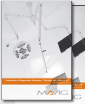
Protection & Suspension Systems Pricelist & Portfolio IPL 2014/1 TP