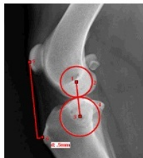
Tibial Tuberosity Advancement