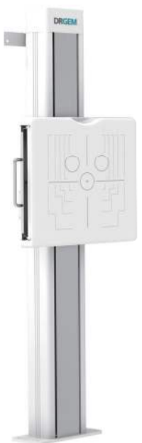
WBS Essential Wall Bucky Stand Elegant design, durable and easy-to-use Wall Bucky Stand