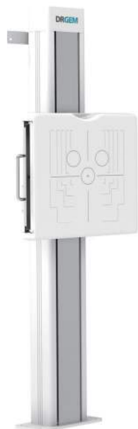
WBS Essential Wall Bucky Stand