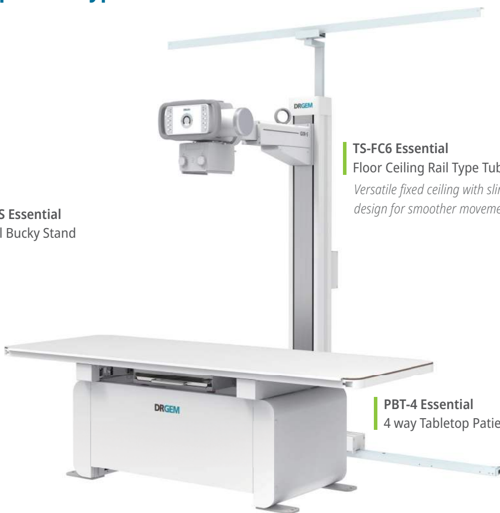
TS-FC6 Essential Floor Ceiling Rail Type Tube Stand Versatile fixed ceiling with slim rail design for smoother movement